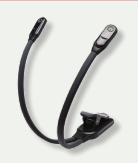
Light up your Holiday event Lights on page 8