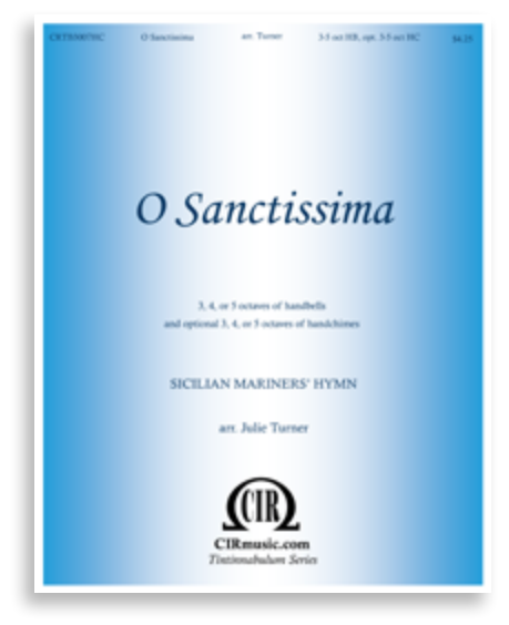
Click to view online listing

This simple yet sensitive setting of the familiar O SANCTISSIMA is filled with lovely harmonies and flowing accompaniment lines. The use of mallets on suspended bells, LVs and Echo Rings adds texture and interest to the piece.