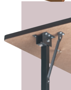
Closeup of adjustable leg

30" x 36" rectangle #3792 $250.00 30" x 30" x 36" trapezoid #3791 $250.00